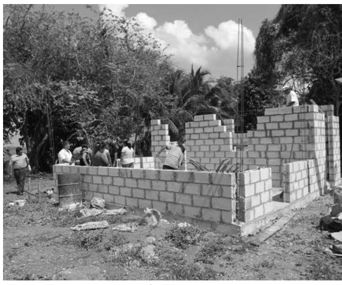
San Carlos Women's Group with Bryant Green, scholar, construction of SunBreeze restaurant

I returned home and began fundraising to support the construction of an actual restaurant in San Carlos. While the Belize learning community and I worked to secure funds to construct and furnish the restaurant, the women's group continued to serve customers in the makeshift building, without refrigeration and simply cooking over a wood fire. I returned to Belize with Mary Ann Studer and one community member in April, 2012 with $4000 that we had raised for the project. The women's group had secured the property for the building, poured a foundation, and ordered all the materials necessary to complete the construction. We purchased the materials for the building itself as well as a freezer and a stove for the Sunbreeze restaurant with the funds raised. This is a wonderful example of an effective partnership, and this project has successfully broken the economic barriers that had restrained the village in the past.