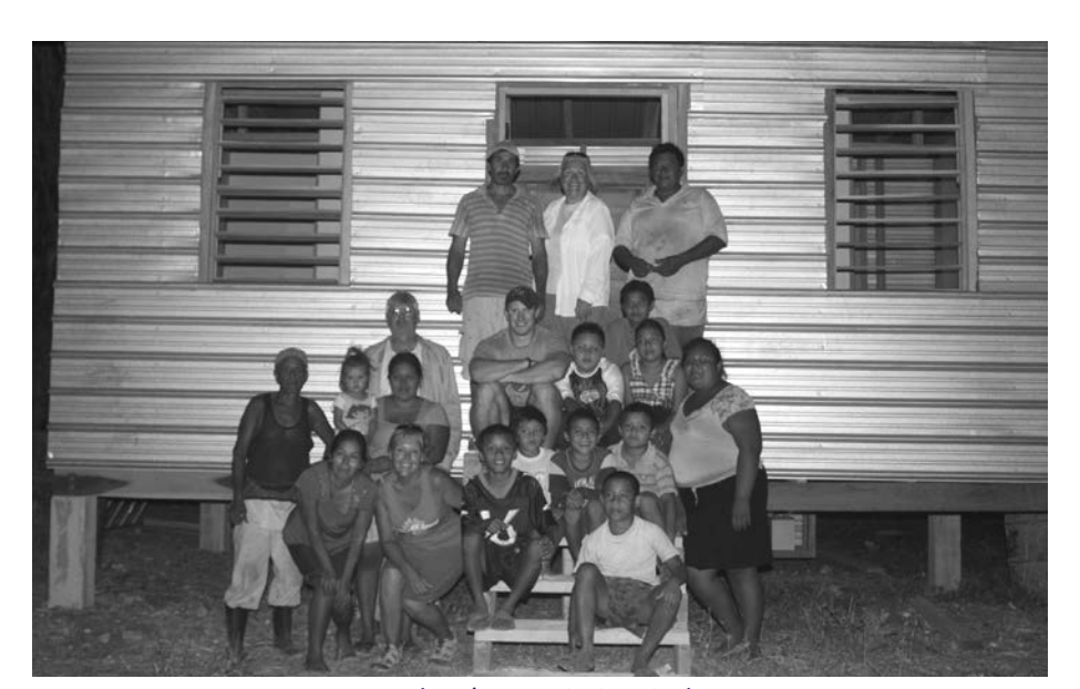
Teachers' House in San Carlos

I created a fundraising plan and strategy to reach my goal of $4,500 to build housing for the teachers. This fundraising plan started prior to my being on the ground in Belize to ensure that I had a template to present to the community leaders and the teachers of the school. This was important because we needed to keep the goal in mind of constructing a plan that worked in partnership with the community of San Carlos. This project was the number one request from both community leaders and teachers. My project continued to progress while I was on the ground in Belize. I found ways to gather the demographics that I needed for my fundraising plan. I mapped out the site for the teacher house, priced materials, and documented the results