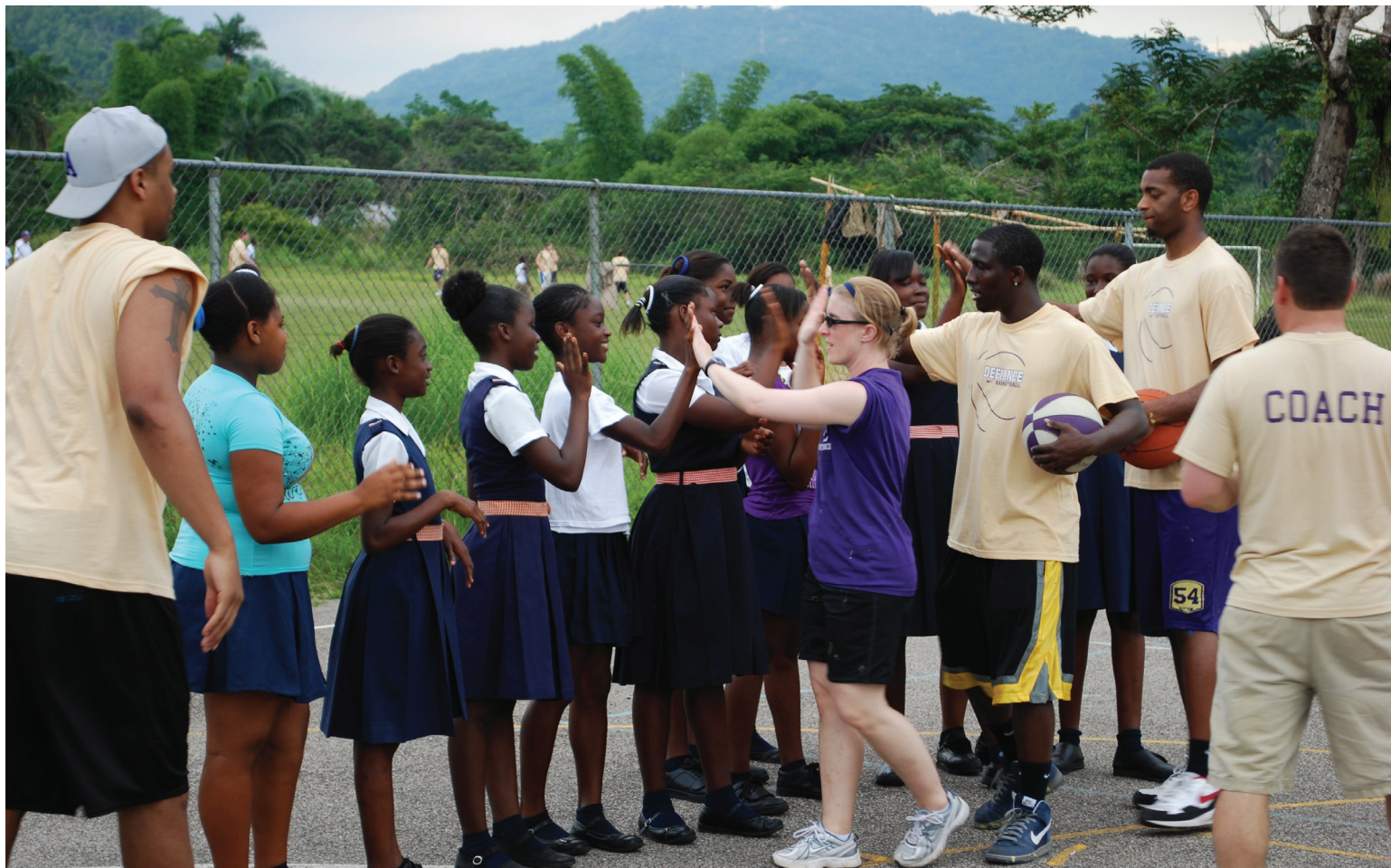
The DC men's basketball team spent a week volunteering at a high school in rural Jamaica.

chosen discipline, their future career, and the positive impact they have the potential to make on humanity. It is the goal of the McMaster School, its affiliate programs, and Defiance College to have our students graduate from here with a much wider view of the world and their place in it as professionals." ♦